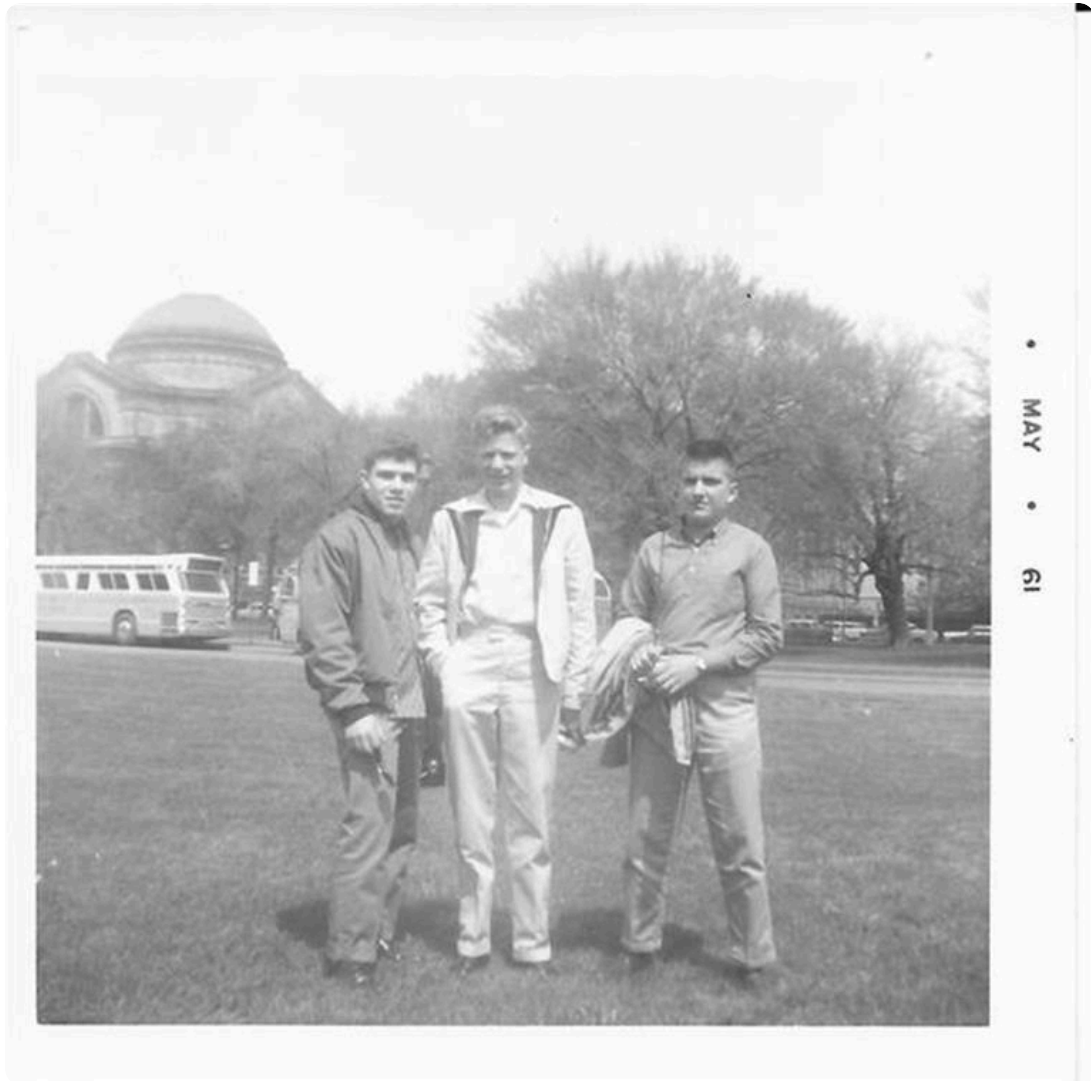
Washington DC 1961